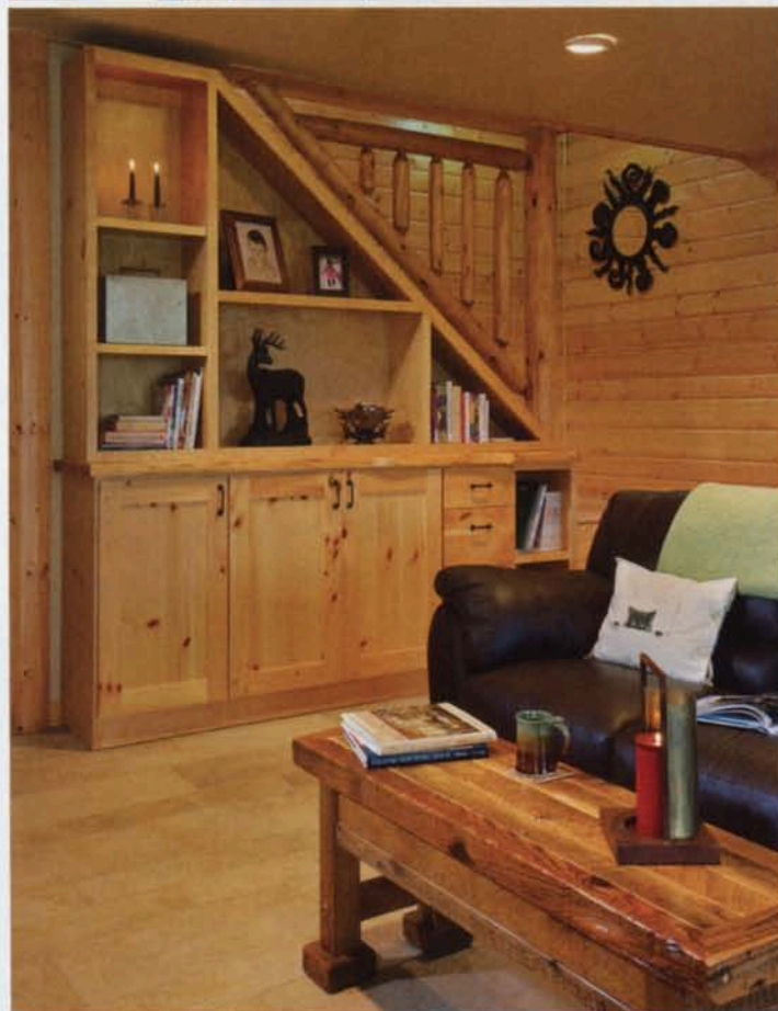
Left: The staircase wall is faced with a large cabinet unit designed with open shelving for book and photo displays and cupboard doors for storing games and toys. Family room flooring is tough porcelain with a heavy texture to help prevent wet feet from slipping.

She thought she had it right until the day before they met with their designer, when Jim informed Sue that he wanted a loft, which her plan lacked. She wanted all of their living space on one floor, but Jim was willing to spend extra for a study where he could find solitude, view the lake and watch eagles, loons and deer, who cross it in winter. They changed the plan one more time and now agree the loft was money well spent.