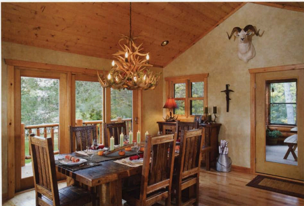
Above: Barn wood dining table, chairs and sideboard are flanked by windows and French doors leading to the three-season porch. Walls are painted warm ivory and textured in a faux plaster finish.